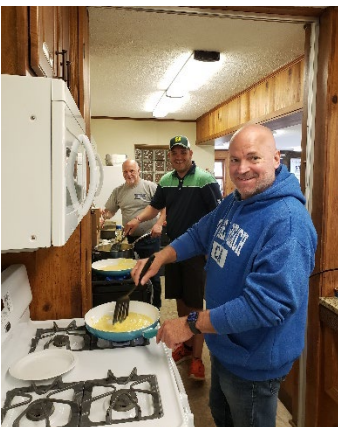
Egg Cooker Volunteers, working hard!