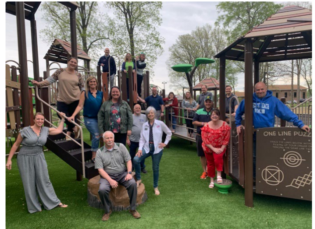
2022 STAR Affiliates in attendance at Breakfast in the Park - our Affiliates are the BEST!

If you missed this years event, plan to attend in May of 2023!